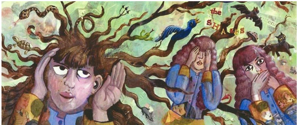
Bridge Street Theatre presents THE SHAGGS: PHILOSOPHY OF THE WORLD